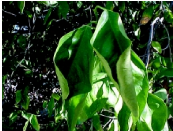
Figure 1. Drought-stressed citrus leaves showing typical curling.

The first sign of water stress is a reduction of fruit size. However this is not very noticeable unless one is watching closely. The first noticeable sign of water stress occurs when the leaves turn a dull green and begin to curl from the edges inward (Figure 1). Continued stress will cause the leaves to begin to dry out and become crisp, starting at the leaf tip, and progressing until the entire leaf is dead. Finally, the leaves will fall off. Flowers and then fruits will also fall. The entire tree will die if water is withheld for an extended period of time.