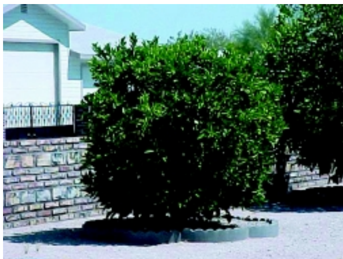
Figure 3. Basin irrigated citrus tree

There are several acceptable application methods. Basin irrigation is often the easiest for the homeowner. Construct a 4 to 8-inch high dike around the tree that is at least as large as the tree canopy (Figure 3). Since the roots actually extend beyond the canopy, a basin that extends about one foot past the canopy is preferred. Then fill the basin as the tree needs water. Do not bank soil around the trunk. Water can touch the tree trunk safely if the trunk is not damaged, and if the tree is not planted too deeply.