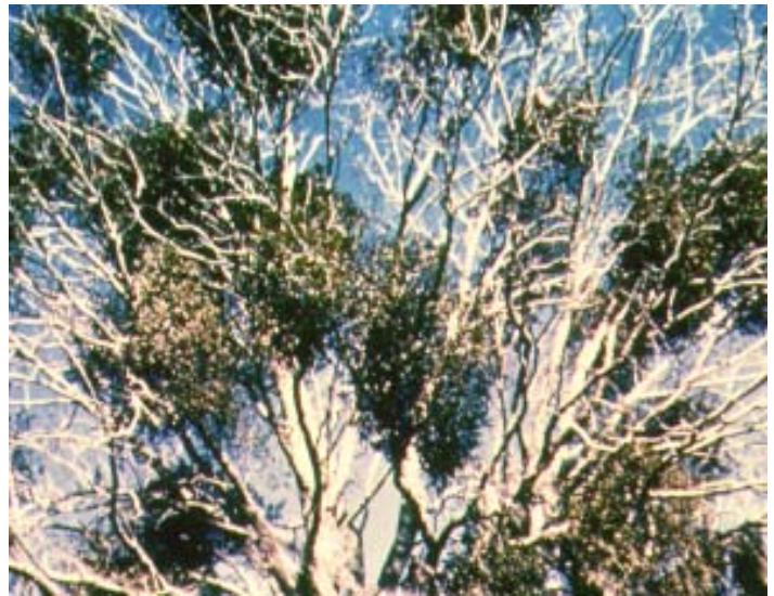
Multiple infections of true mistletoe.

Area wide efforts to clean out trees in an entire neighborhood or development may be effective in preventing infections in new trees, but requires the cooperation of a large