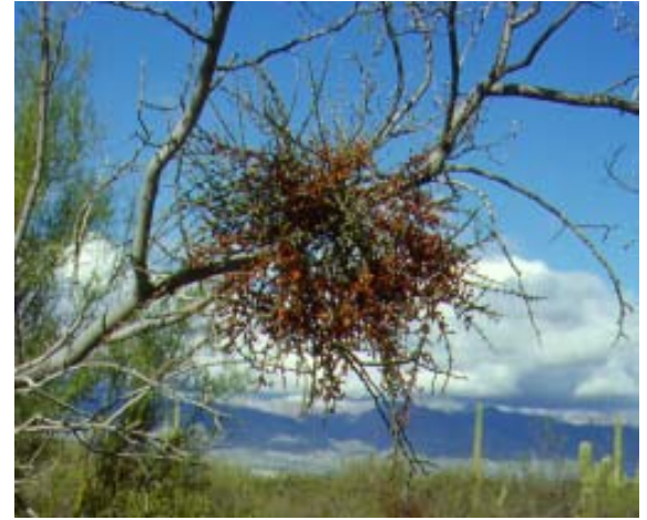
True mistletoe aerial shoots with berries.